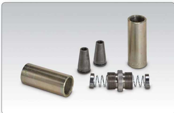
▲ Reusable splice chuck components